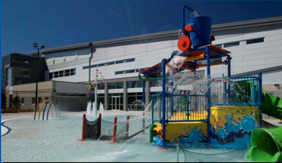
West Gwinnett Park and Aquatic Center