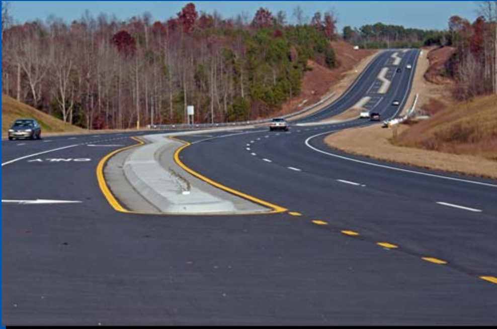
Satellite Boulevard extension