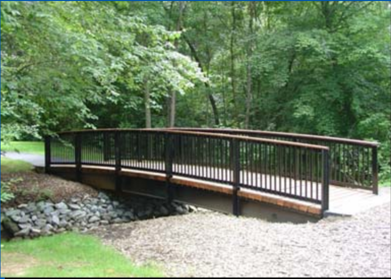
City of Duluth