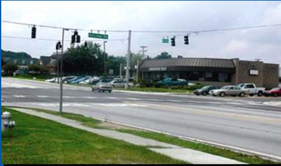
Oak Road realignment at U.S. 78 (joint venture with County)