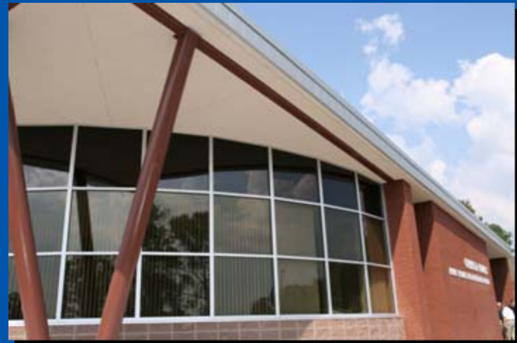
Animal Welfare and Enforcement Center