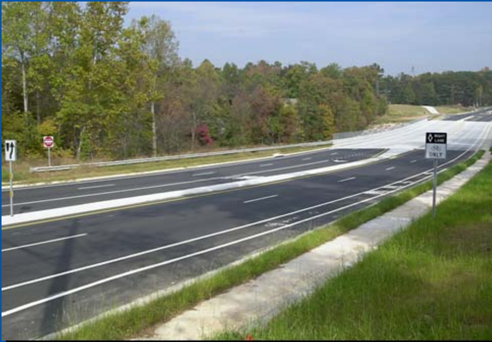
Annistown Road Widening