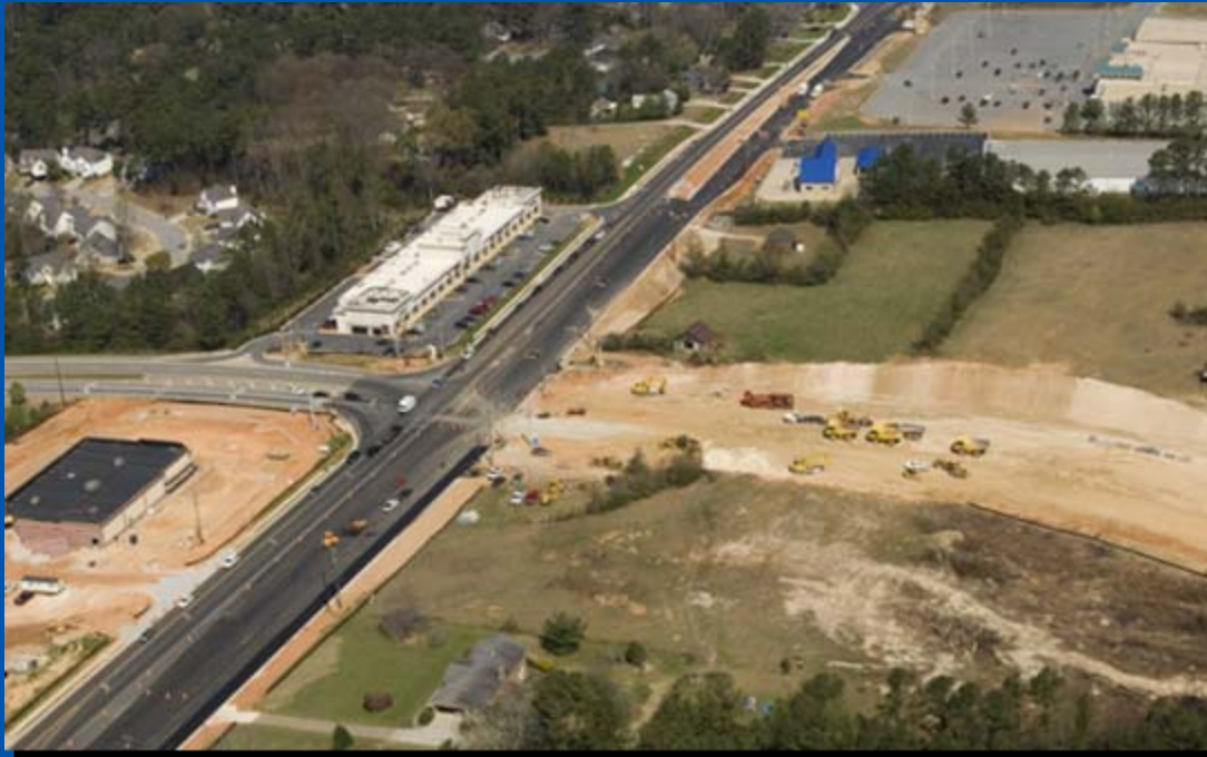
Sugarloaf Parkway at SR-20 extension