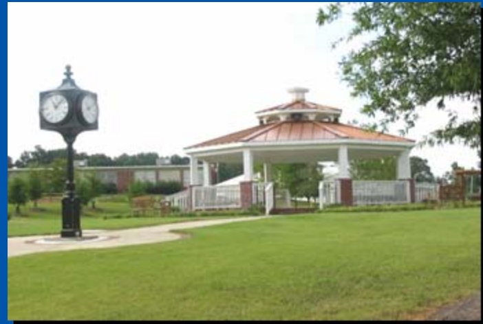
City of Sugar Hill