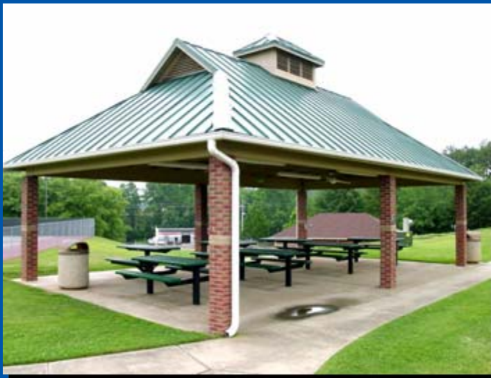
City of Buford