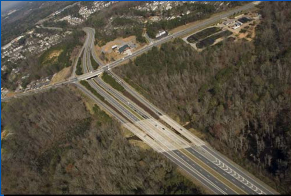
Ronald Reagan Parkway