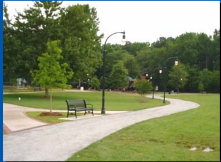
City of Lilburn