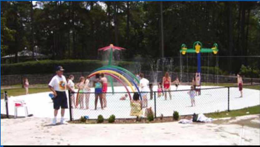
City of Snellville