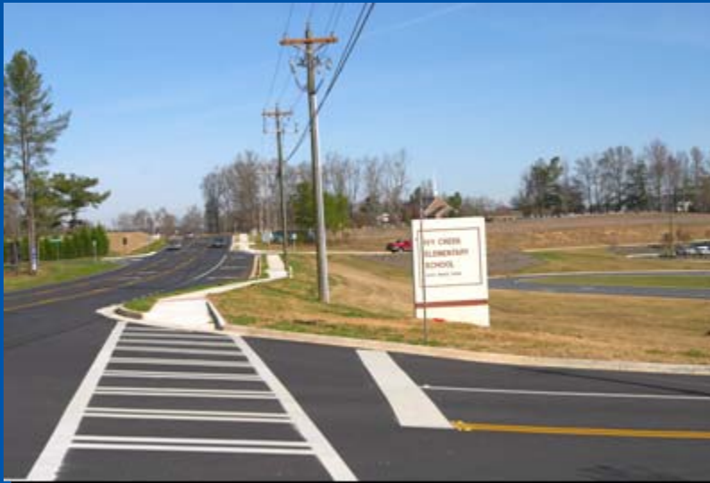
Safety Project at Peachtree Ridge High School